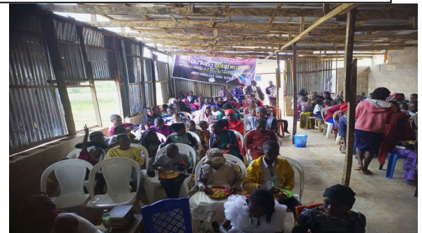
Children (ages 3-12years) enjoying their meal during the just concluded Children Bible Seminar.